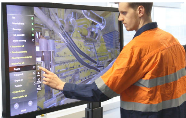
Pre-start Inspection – Training and Assessment tool