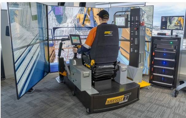
LX6 simulator equipped with autonomous panel

Focused on capability development in the usage of the autonomous system, Rio Tinto partnered with Immersive Technologies to provide a solution to support the mine readiness schedule and objectives. Specific training products include a platform which simulates a CAT 6060 Excavator, CAT D10T Dozer and CAT 18M Grader. All simulator modules are equipped with an autonomous system panel and provide a safe and effective environment for training by allowing learners to operate their equipment while interacting with the autonomous trucks and managing their work areas as required.