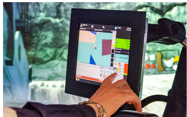
Panel Add-On Image Excavator

The simulator solution is complimented by machine pre-start inspection software which provides a detailed visualization of equipment components, including autonomous components fitted to machines. Additionally, a Virtual Classroom product